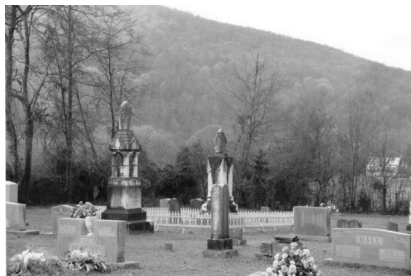
Princeton Cemetery, Jackson County; Listed in the National Register of Historic Places