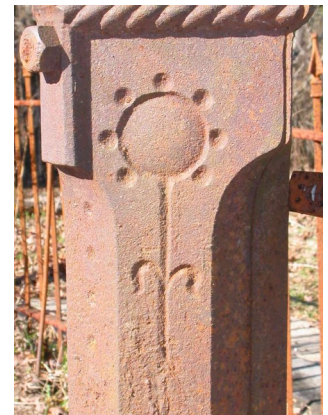
Decorative iron fence post at the New Cemetery at Old Cahawba, Alabama's first state Capitol.