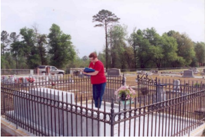
Documenting a cemetery is vital to any project