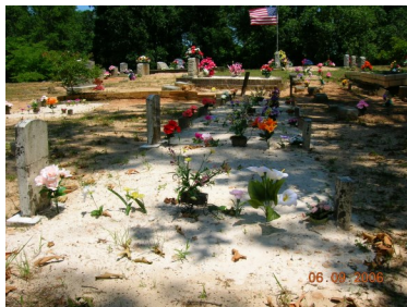
Mounded graves: Custom where length of grave is covered with a mound of dirt, which is often rebuilt each year during Decoration Day